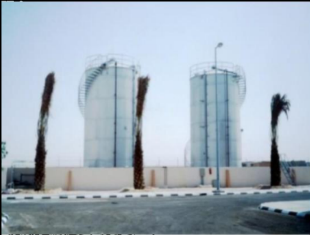
Monthly Fuel Tank at Al Batha Power Plant