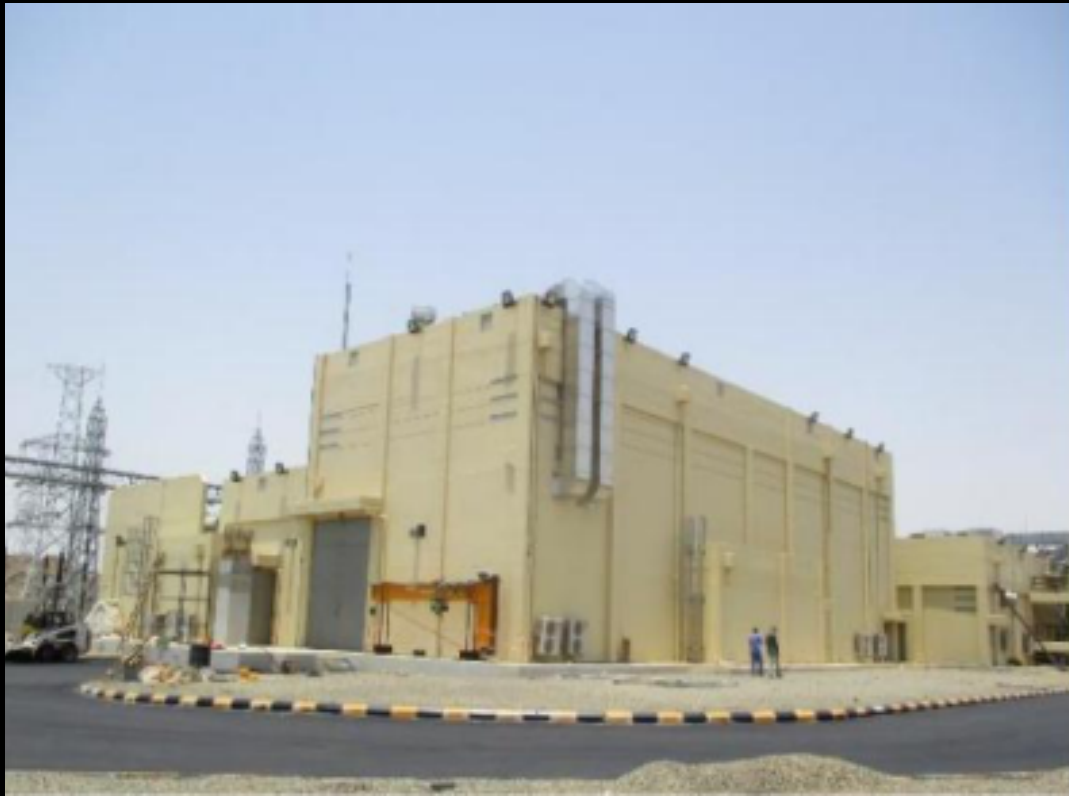
Adam 110 KV substation testing