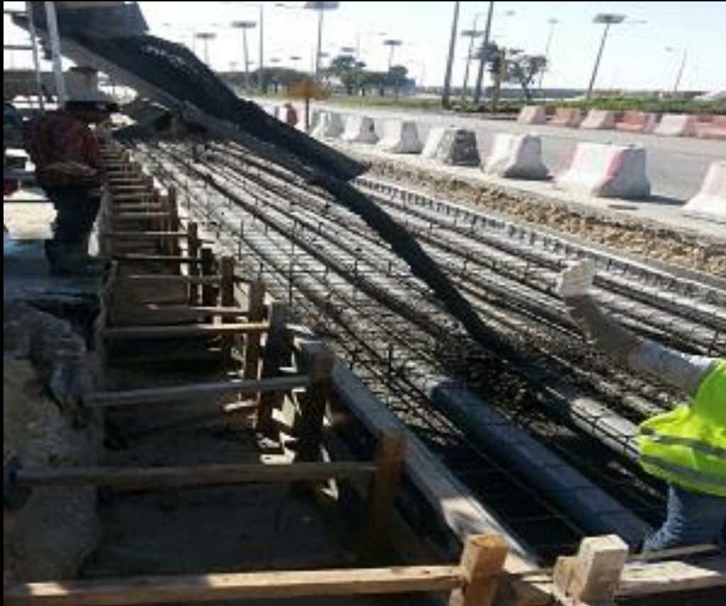
Concrete Pouring at CBD.11 at KAAP 115 KV substation