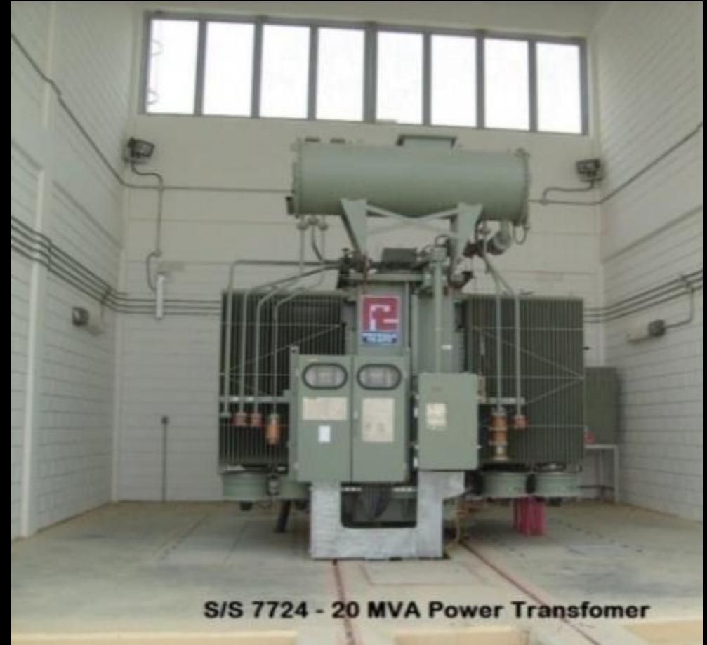
SIS 7724 - 20 MVA Power Transformer