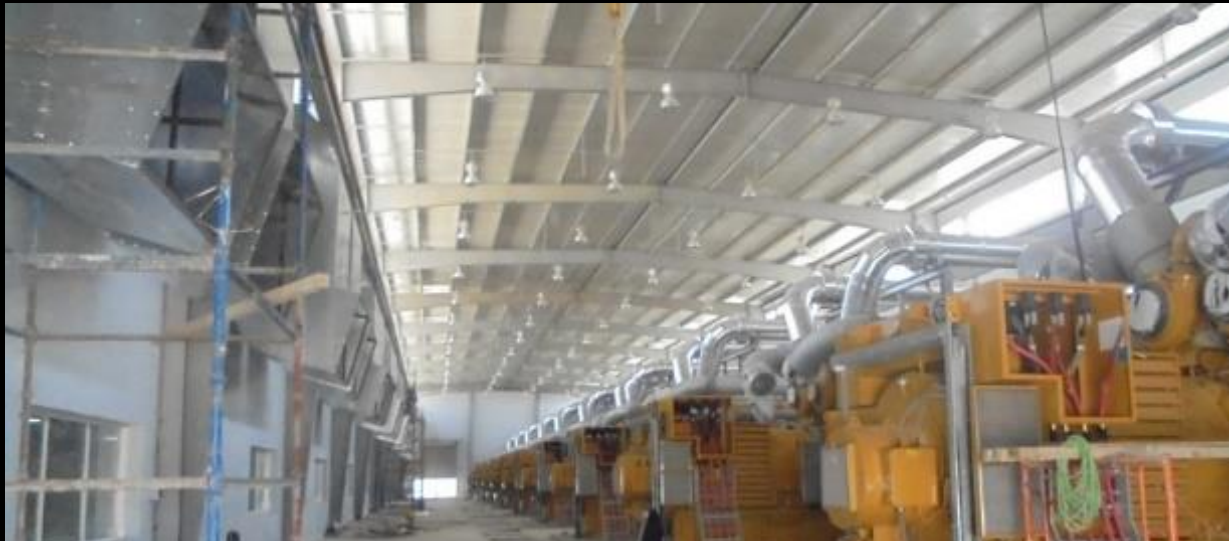
Al Ruqi 50 MW Power Plant