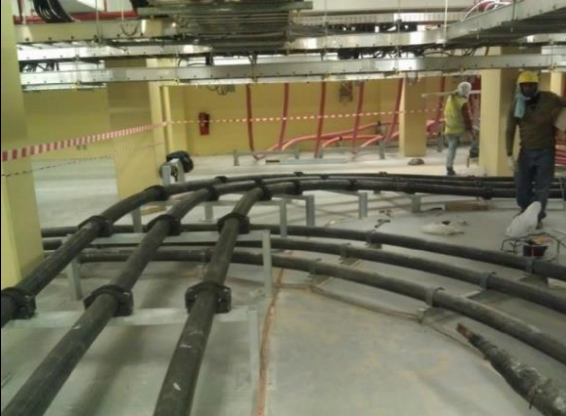
Power Cables at Al Takhassusi 110 KV