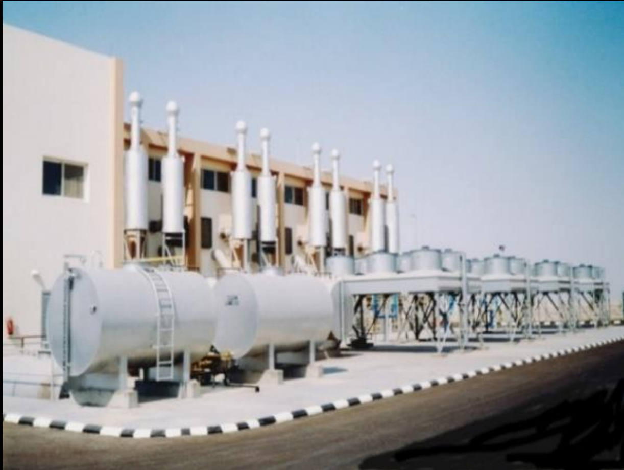
Batha Power Plant side view