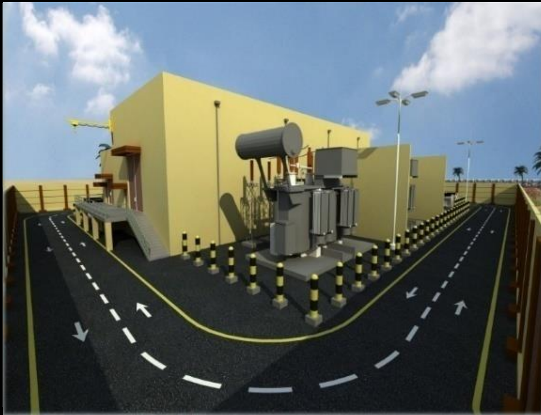
1KAAP 115 KV 3d View