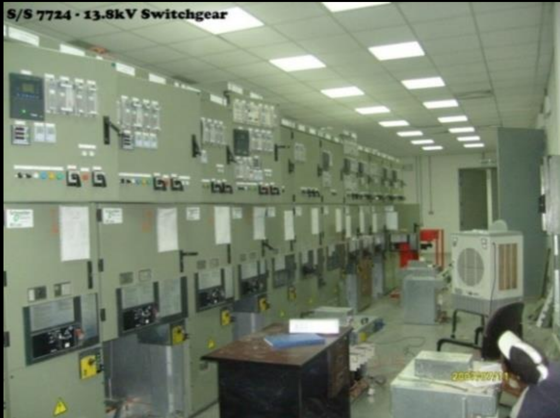
Al Ruqi 50 MW Power Plant